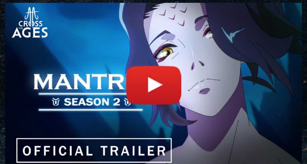
Saison 02 - Mantris