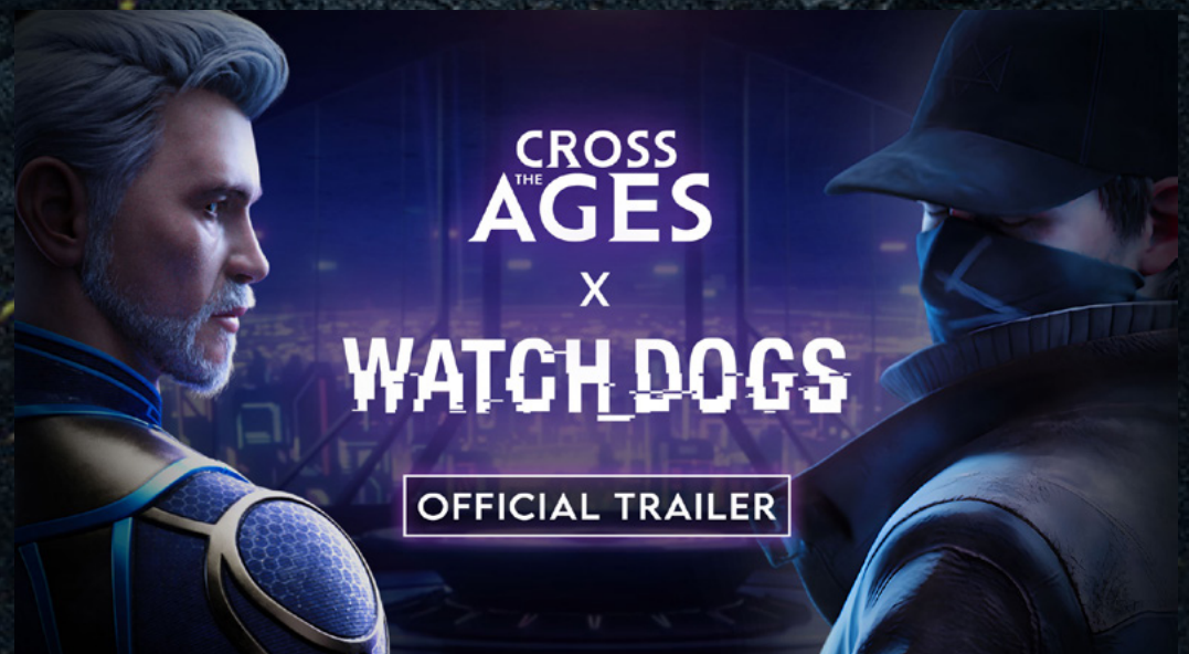
Cross The Ages X Watch Dogs