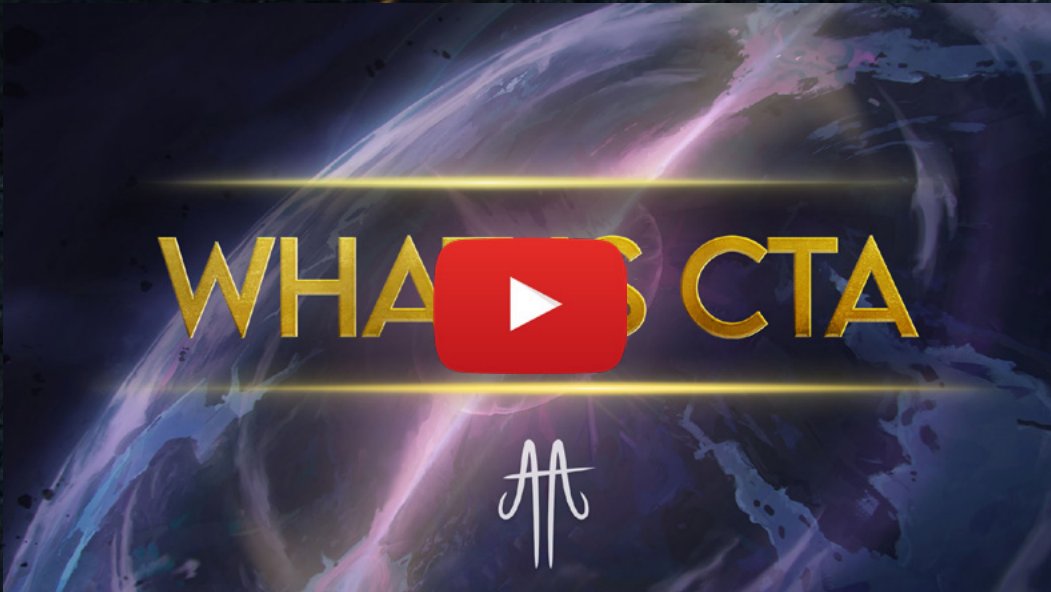
What is Cross The Ages?